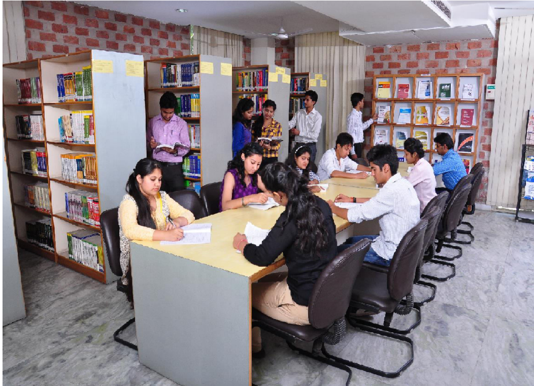
One central Library